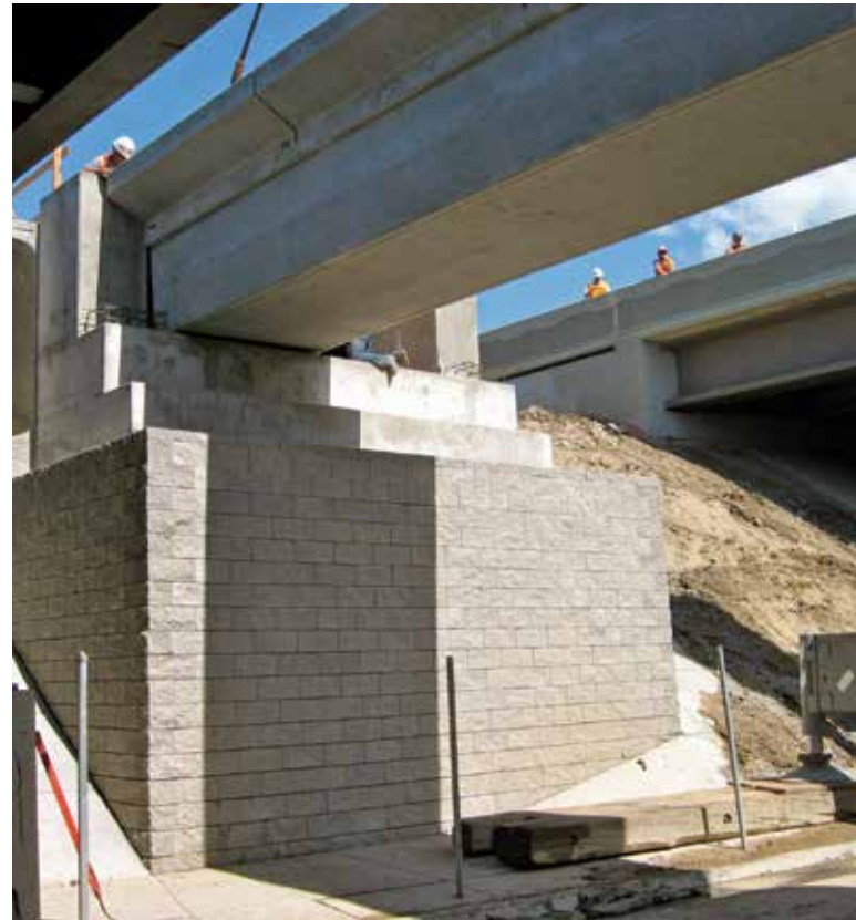
Completed Abutment with beams being set