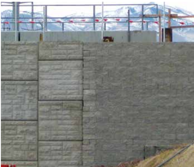
Keystone wall takes over from panel wall system with a smooth transition

The large Flyover walls over the UPRR were originally planned as a two-stage construction due to foundation settlement concerns. This means that, once excavation is done, a flexible wire mesh MSE (mechanically stabilized earth) wall is installed and allowed to settle. The second stage involves installing a permanent concrete veneer, panels, block or other product of the customer's choosing in front of the wire mesh wall. The result is that the wall is built twice. It may not