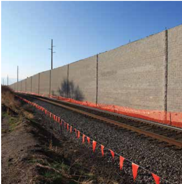
Above: "Flyover" wall slip joint construction Below: "Flyover" crosses over UPRR tracks on skew

This project team helped the Utah Transit Authority (UTA) build two commuter rail lines. The FrontRunner North Commuter Rail Line runs from Salt Lake City north to Ogden. The FrontRunner South Commuter Rail Line runs from Salt Lake City south 45 miles to Provo. FrontRunner North has 5,000 square feet of retaining wall. FrontRunner South has 300,000 square feet of retaining walls. Because of the size and number of walls, our case study will focus on FrontRunner South.