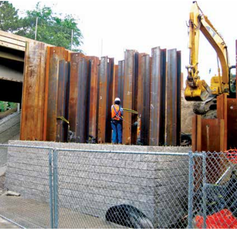
Abutment construction in between interstate bridges

Large retaining walls and poor foundation soils have settlement issues. This issue was addressed by a wick drain system that was designed and installed under the walls. The excavation team drilled 80 feet into the ground at predetermined intervals and fed 6-inch diameter wicking material into the holes to accelerate clay soil drainage from the large retained fill surcharges. Wicking the water out of the ground faster and draining it away helped accelerate settlement and reduces the long term settlement duration.