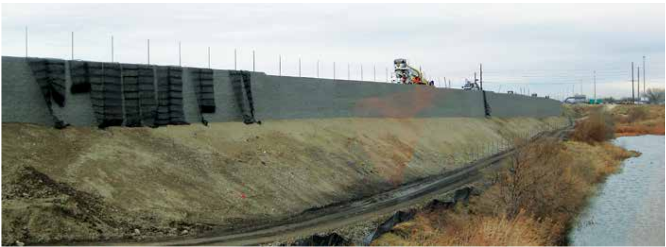
Typical Keystone railroad support walls under construction

Single-phase construction, slip joint construction, locally manufactured Keystone products, high productivity installation, wick drain installation, lightweight backfill, and low maintenance add up to a one-of-a-kind commuter ride.