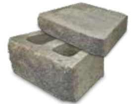
JAWS Technology® face option available in certain markets.