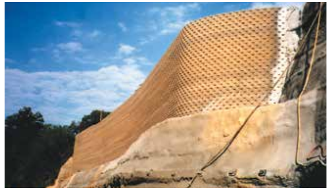
View of wall with soil nailed "bench" below.

Conventional fill, such as sand, would have cost about $5 per cubic yard placed, while the cost of the lightweight aggregate solution was approximately $30 per cubic yard placed. This lightweight material was needed to solve the problem due to the inability of the underlying wall to carry the load of the conventional fill. Combining these various stabilization systems was an economical and yet ideal solution.