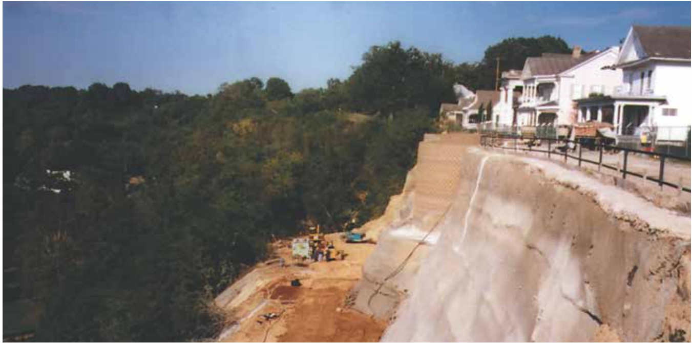
The top of the Keystone wall provides new front yards for bluff homeowners.