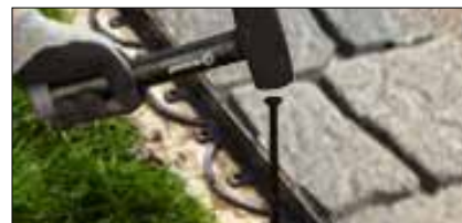
5. Edge Restraint

Lay patio stones in the desired pattern. If the desired pattern requires cutting, the patio stones can be cut with a wet saw.