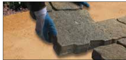
4. Lay Stones

Lay a 1in. (25mm) outside diameter pipe on base. Spread 1in. (25mm) of sand over compacted base. Level the sand by dragging a 2in. x 4in. (51mm x 102mm) board over pipe.