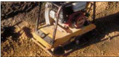
2. Base & Compact

Excavate the installation area to approximately 6in. (152mm) larger on all sides than the actual finished size.