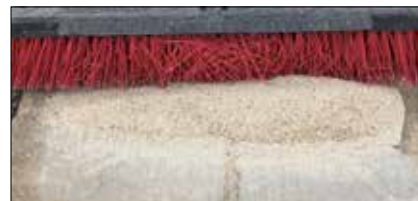
6. Sand & Finish

Install patio restraint edging and spikes around the project, according to the manufacturer's instruction.