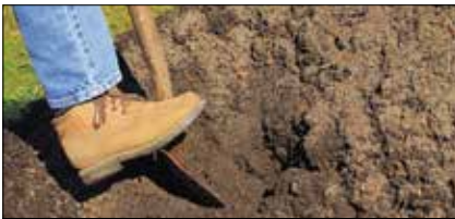
1. Mark & Dig

Excavate the installation area to approximately 6in. (152mm) larger on all sides than the actual finished size.