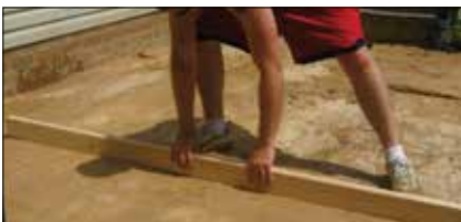
3. Base Preparation

Install patio base to a compacted finished thickness of 4in. (102mm) for patios and walkways.