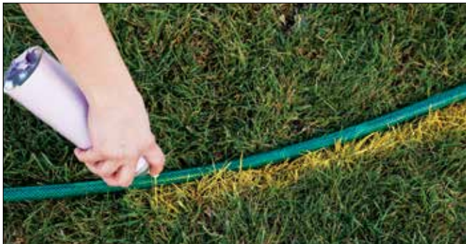
Mark & Dig

Mark an outline of your project. Then dig a shallow trench 3" (76mm) deep by 6" (152mm) wide to receive the edging unit.