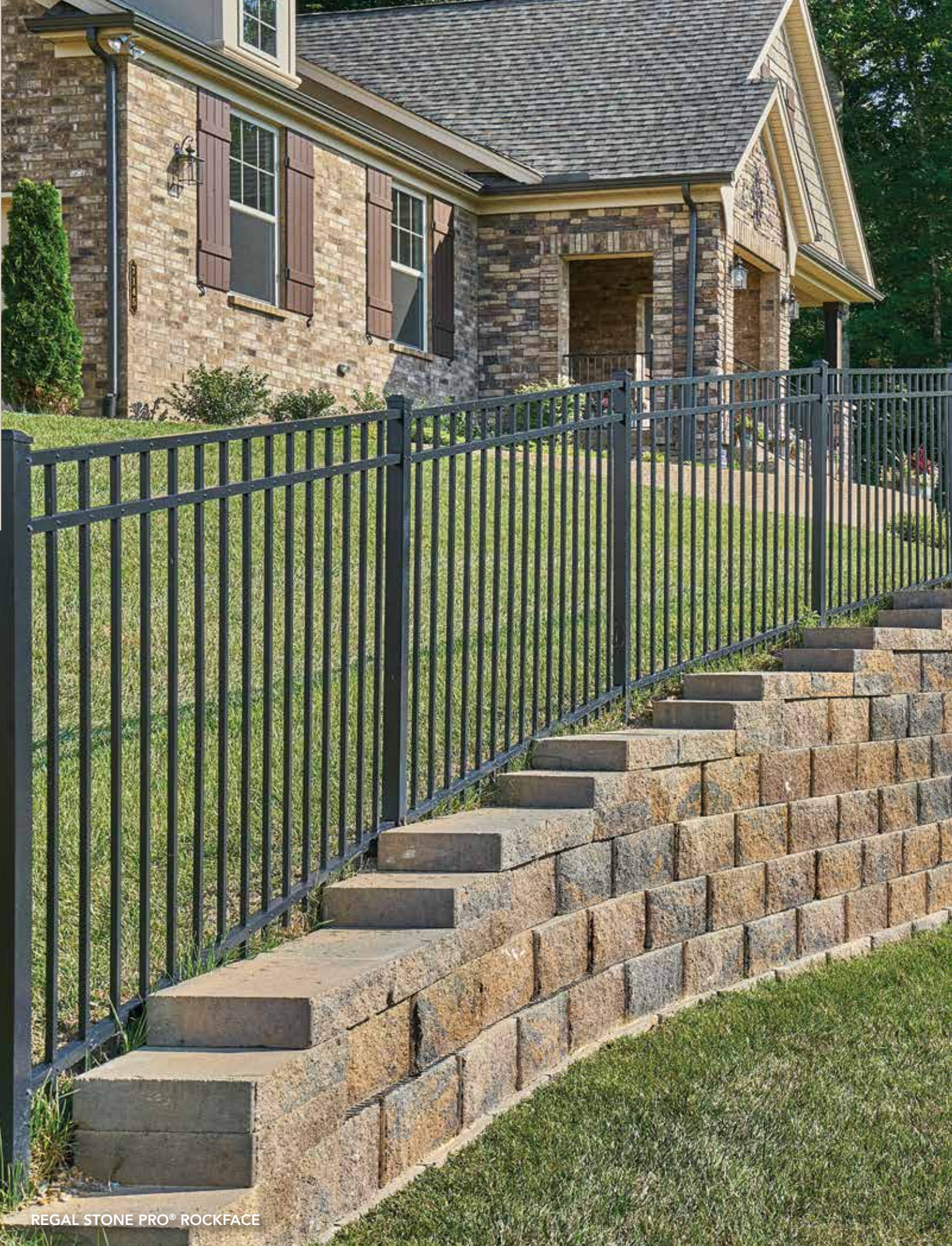
REGAL STONE PRO® ROCKFACE