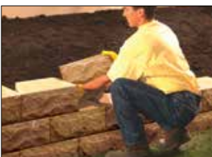
3. Install Additional Courses

Backfill first course units with clean granular fill material (i.e. crushed stone/gravel). DO NOT USE PEA GRAVEL! Compact with hand tamper or appropriate mechanical compactor. Backfill and compact behind each course before installing additional courses.