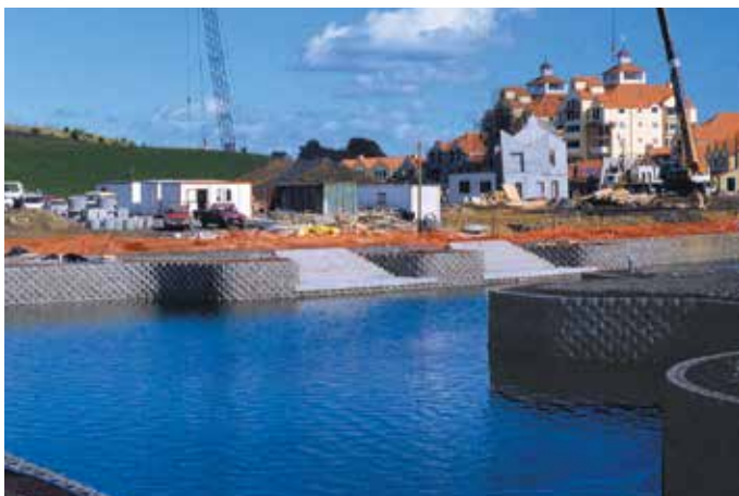
Gulf Harbour site during construction.