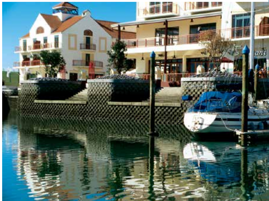
Gulf Harbour Marine Village project with Keystone canal walls.