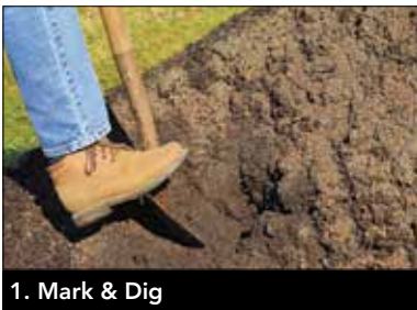
1. Mark & Dig

Excavate the installation area to approximately 6 in. (152mm) larger on all sides than the actual finished size.