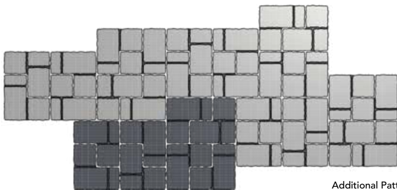
Additional Pattern Options