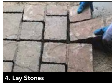
4. Lay Stones

Lay a 1 in. outside diameter pipe on base. Spread 1 in. of sand over compacted base. Level the sand by dragging a 2 in. x 4 in. (51mm x 102mm) board over pipe.