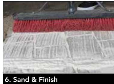
6. Sand & Finish

Install patio restraint edging and spikes around the entire project, according to the manufacturer's instruction.