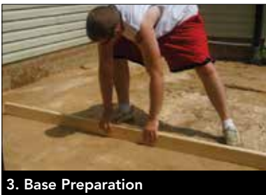
3. Base Preparation

Install patio base to a compacted finished thickness of 4 in. (102mm) for patios and walkways.