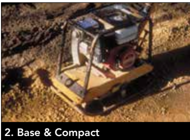
2. Base & Compact

Excavate the installation area to approximately 6 in. (152mm) larger on all sides than the actual finished size.