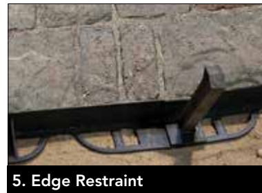
5. Edge Restraint

Lay patio stones in the desired pattern. If the desired pattern requires cutting, the patio stones can be cut with a wet saw.