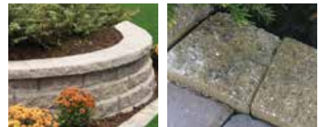
Complementing Insignia wall & Insignia edger