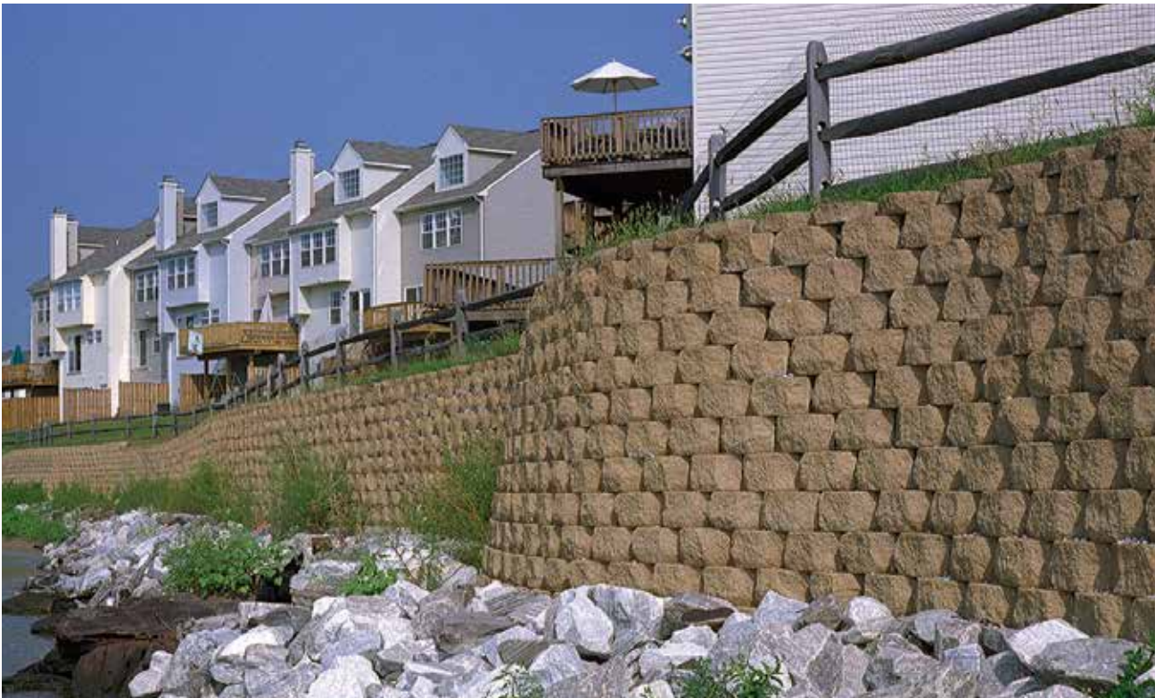
Keystone walls offer an aesthetically pleasing solution at Stoney Beach while providing stability to the shoreline.