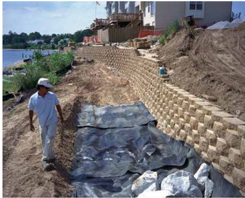
Installing the rip-rap at the base of wall

A wood fence was installed on top of the wall to provide a guard rail barrier and to complete the yard space provided by the Keystone System. Total cost for the project was approximately $200,000 with an average per square foot cost of $19.64. The rip-rap in front of the wall added an additional $35,000.00.