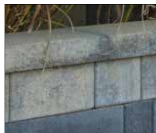
6. Capping the Wall

Place the shouldered fiberglass pins into the holes of the Units (note: place one pin only per each grouping of three holes). Place pins in the middle hole for near vertical alignment or the holes nearest the embankment for a 9.5° +/- setback per course. According to wall requirements and design, the front pin hole (towards the face of the wall) can be used randomly to allow a forward projection of a specific unit for accent and variation in the wall appearance.