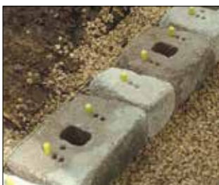
3. Insert Fiberglass Pins

Place the next course of units over the fiberglass pins, fitting the pins into the long receiving channel recess of the units above (Note: Some removal of debris in the pin holes and channel may be necessary prior to placement). Push the units toward the face of the wall until they make full contact with the pins. If pins do not connect with channel but align in open core of upper unit, place drainage fill in core to provide unit interlock with pin. For near vertical alignment, center the unit above over the center placed pins below.