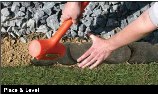
Place & Level

Mark an outline of your project. Then dig a shallow trench 3" (76mm) deep by 6" (152mm) wide to receive the edging unit.