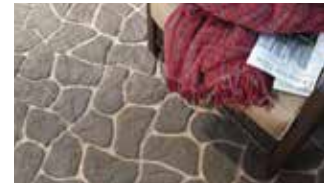
Complementing Alameda patio stone