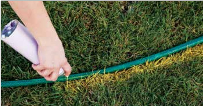
Mark & Dig

Mark an outline of your project. Then dig a shallow trench 3" (76mm) deep by 6" (152mm) wide to receive the edging unit.