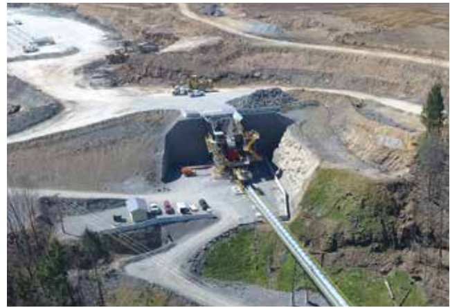
Aerial photo of the new Allegheny Mine 24 crushing station.

the dump platform so that material can be safely offloaded into the crushing tower.