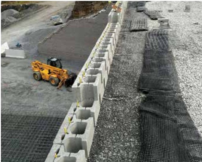
Construction progress of the primary crushing tower retaining wall.

The primary crushing tower retaining wall was manufactured by The Bauer Company, Inc. and Kevcon, Inc. Installation was performed by Proscap Landscape Supply of New Stanton, Pennsylvania. The Keystone wall length is 194 feet, with a total area of 6,848 square feet and a maximum height of 47 feet. Due to the wall height and off-highway truck loading, crushed limestone was used as reinforced fill material behind it.