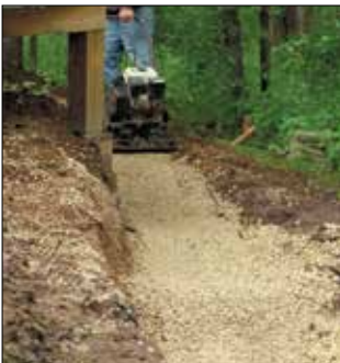
1. Prepare Base Leveling Pad

Remove all surface vegetation and debris. Do not use this material as backfill. After selecting the location and length of the wall, excavate the base trench to the designed width and depth (min. 20" w x 12" d) [500mm x 300mm]. Start the leveling pad at the lowest elevation along wall alignment. Step up in 6" (150mm) increments with the base as required at elevation changes in the foundation. Level the prepared base with 6" (150mm) of well-compacted granular fill (gravel, road base, or 1/2" to 3/4" [10 - 20 mm] crushed stone). Compact to 95% Standard Proctor or greater. Do not use PEA GRAVEL or SAND for leveling pad.