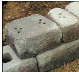
5. Install Additional Courses

Place the first course of units end to end (with front corners touching) on the prepared base. The long groove (receiving channel) on the unit should be placed down and the three pin holes should face up, as shown. Make sure each unit is level - side to side and front to back. Leveling the first course is critical for accurate and acceptable results. For alignment of straight walls, use a string line aligned on the unit pin holes for accuracy. Minimum embedment of base course is 6" (152mm) below grade.