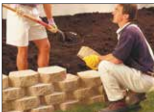
3. Install Additional Courses

Place and level the first Keystone Garden Wall unit. Level each additional unit on the base course as you place it, making sure that the outside edges touch. If your wall contains both straight and curved areas, start with a straight area and build into the curves. Complete the base course before proceeding to the second course.