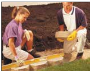
2. Place & Compact Backfill

Start by digging a shallow trench 4" (102mm) deep by 12" (305mm) wide. Cut through and remove any sod, roots or large rocks. For organic loam soils, dig 4" (102mm) deeper and add a leveling pad of sand or gravel. Compact and level the soil to receive the first course of Keystone Garden Wall.