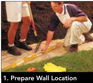
1. Prepare Wall Location

Start by digging a shallow trench 4" (102mm) deep by 12" (305mm) wide. Cut through and remove any sod, roots or large rocks. For organic loam soils, dig 4" (102mm) deeper and add a leveling pad of sand or gravel. Compact and level the soil to receive the first course of Keystone Garden Wall.