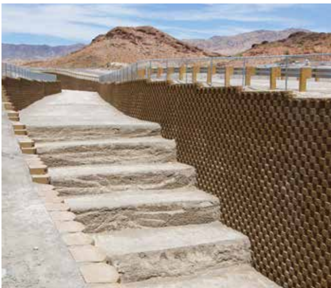
Channel Walls G & F and Access Road

For more information on the Keystone Compac II unit or other innovative Keystone products, please visit www.keystonewalls.com or call 800-747-8971.