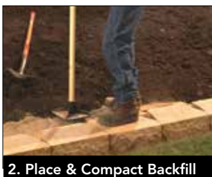
2. Place & Compact Backfill

At wall location, dig shallow trench for wall base (see Typical Legacy Stone Section). Place granular leveling pad material. Compact and level the base pad. Place and level the first course units. If grade changes along base of wall, create stepped leveling pad as required. Always start wall at lowest elevation, working to highest. Complete base course before proceeding with additional courses.