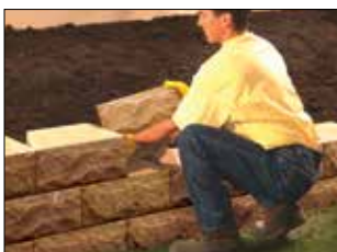
3. Install Additional Courses

Backfill first course units with clean granular fill material (i.e. crushed stone/gravel). DO NOT USE PEA GRAVEL! Compact with hand tamper or appropriate mechanical compactor. Backfill and compact behind each course before installing additional courses.