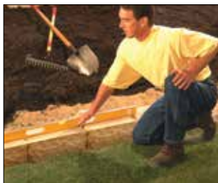
1. Prepare Wall Location

At wall location, dig shallow trench for wall base (see Typical Legacy Stone Section). Place granular leveling pad material. Compact and level the base pad. Place and level the first course units. If grade changes along base of wall, create stepped leveling pad as required. Always start wall at lowest elevation, working to highest. Complete base course before proceeding with additional courses.