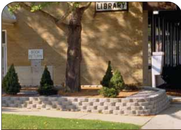
Curb & Sidewalk Borders