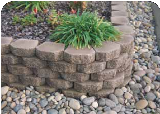
Flower Beds or Planters