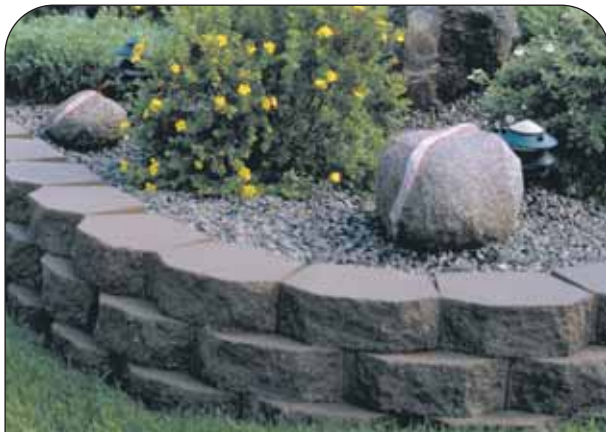
Garden Borders or Tree Rings