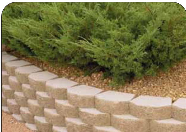
Patio, Lawn or Sidewalk Edging