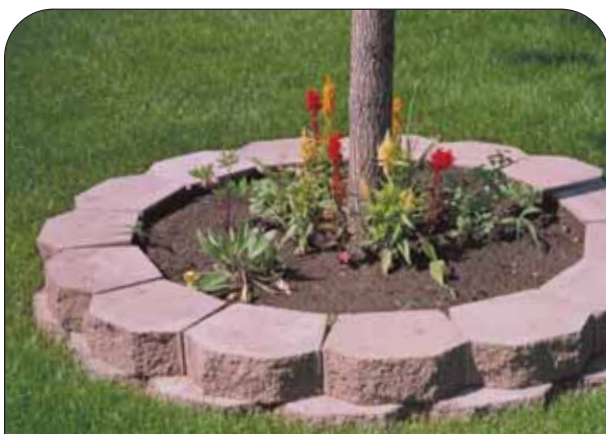
Tree Rings or Planters