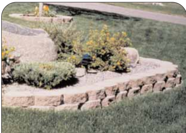
Garden Borders or Planters