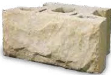
Keystone Compac Hewnstone Unit*

Experience the Sculpterra™ Technology difference.