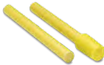
Keystone Fiberglass Pins

8" h x 18" w x 12" d (200 x 300 x 450 mm) *85 lbs • (39 kg)