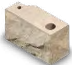
8" 90° Corner Unit*

8" h x 15" w x 6" d (200 x 150 x 380 mm) 50 lbs • (25 kg)